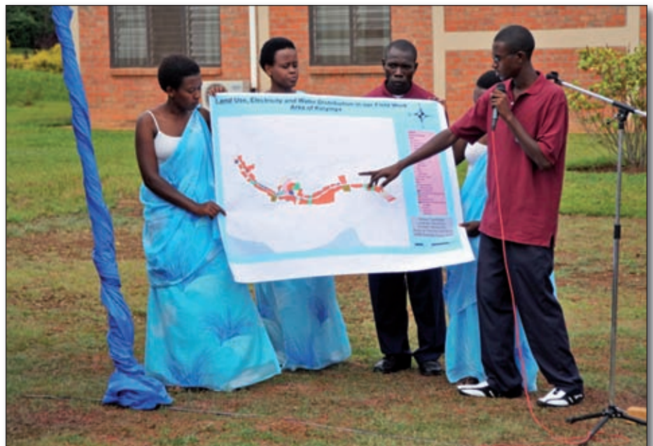
ESRI summer camp Rwanda: Students presenting their work

This was the beginning of a series of exciting one-week research camps, teaching hundreds of children about important questions sur-